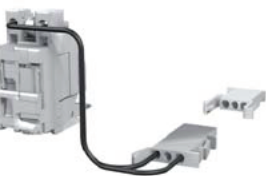
UVR for withdrawable