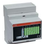
Time delay device for undervoltage release