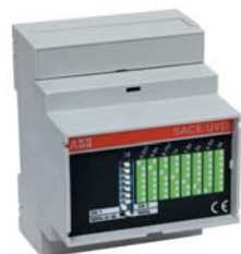
Time delay device for undervoltage release