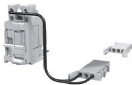
SOR for withdrawable