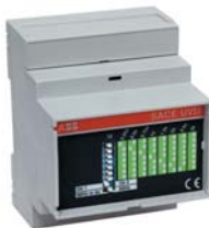
Time delay device for undervoltage release