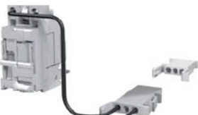
SOR for withdrawable