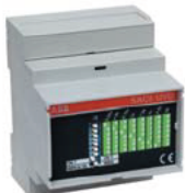
Time delay device for undervoltage release